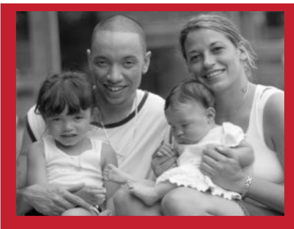
Family Promise of Irving is a 501(c)3 non-profit organization. All donations are tax-deductible.